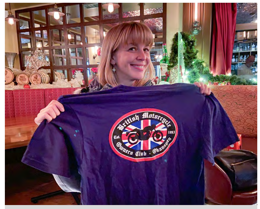
Okanagan photos © Pablo Picante