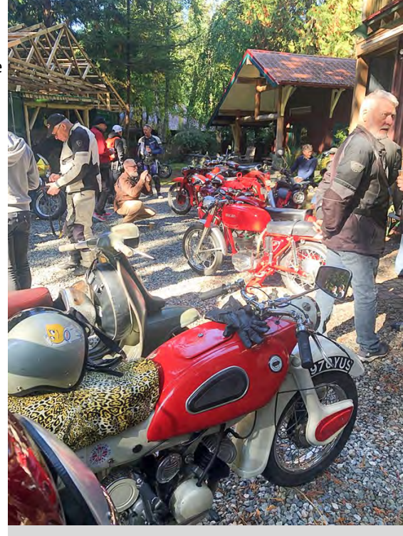
Past President Joe's Ariel Arrow

escaped from the little black box that told the coil when to send a pulse to the spark plug and the bike refused to start. Not a big problem: the bike and rider were transported back to Moto Largo and the Ariel rider caught a pillion ride to the ferry on a more functional Vespa. The Ariel was securely stored at Moto Largo until the errant parts were sourced and the rider was able to return to make the needed repairs. The little Ariel was ridden home a couple of weeks later. There was one other reported incident that involved a scooter leaving the road and the rider being unceremoniously deposited into the ditch with no