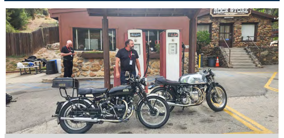
The Rock Store

The day after the concourse and banquet it was time to start the ride home. We did the return trip entirely on our own. For the most part we travelled the same way home. One of the amazing things was how much my riding skill had improved from a few weeks of riding on fast winding roads every day. When we did arrive back at the 300 curves in 22 miles part of Hwy 1 which I was looking forward to, I found instead of a very challenging road, I found it was just a great scenic drive. During the last three days of our return trip, we hit a bad storm, heavy rain and high winds made the ride a lot less fun, but it was still memorable.